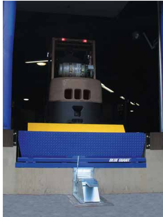
XDS 3000 shown