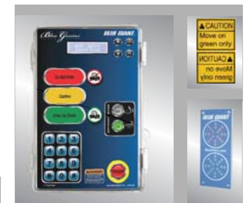
Blue Genius Gold Series I with exterior light and sign