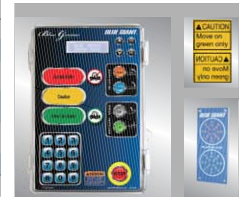
Blue Genius Gold Series III with exterior light and sign